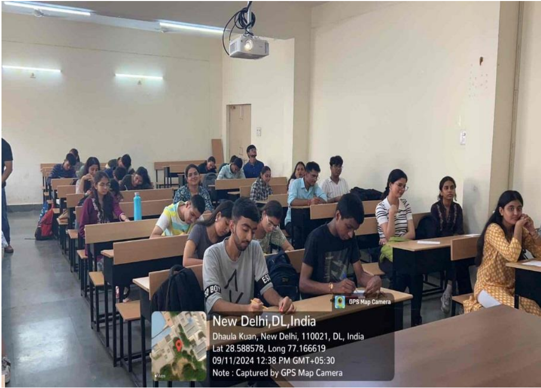
Orientation with Participants