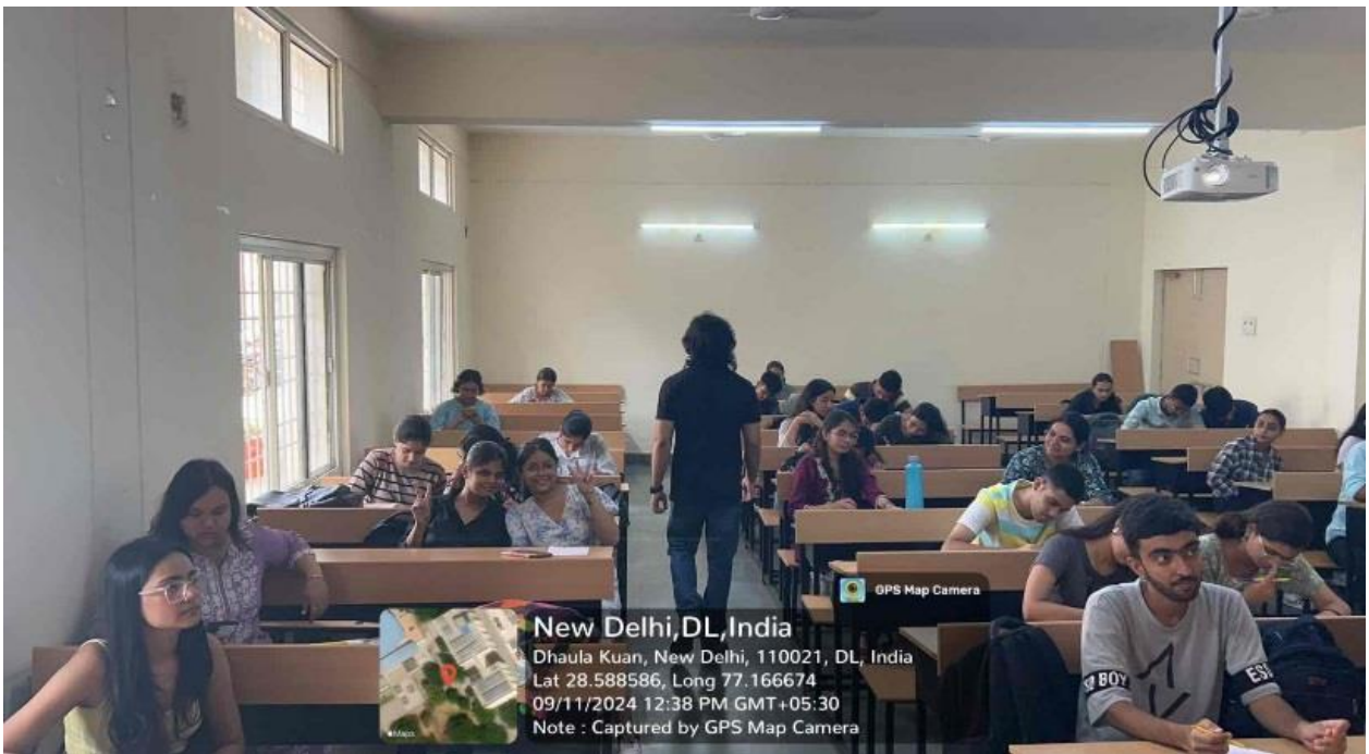
Orientation with Participants